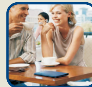
Pay at the Table